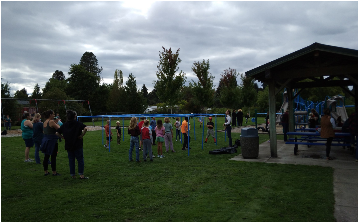
Ice Cream Social was well attended. 9-Square was a big success.