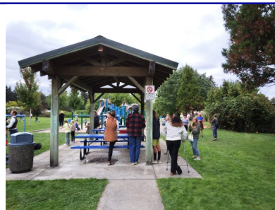
The ice cream social was held at Miller Park on September 11.